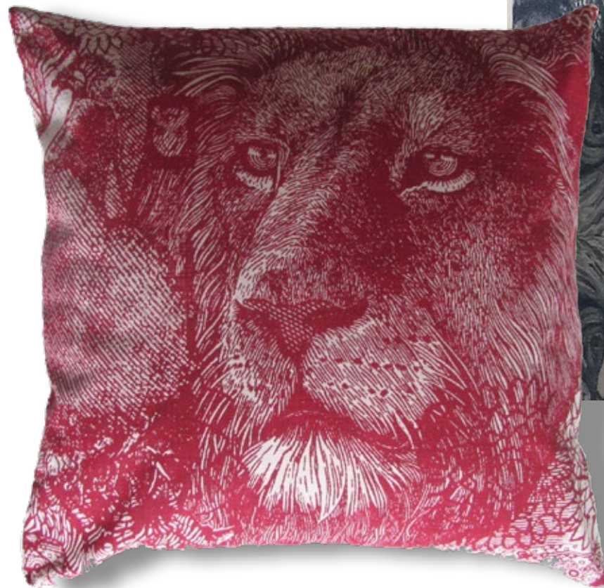
Cushion size: 60 x 60cm

Money Animals works well for cushions, upholstery and can be used for curtains and blinds. Also available as a wallpaper in collaboration with Robin Sprong wallpapers.