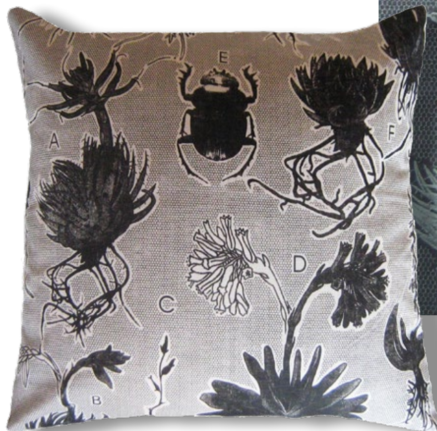
Cushion size: 60 x 60cm

This fabric makes a connection to the natural world. The symbol of the scarab, dung beetle, has been included to represent transformation. Liliaceae works well for outdoor living spaces as well as for curtains, blinds, upholstery and cushions.